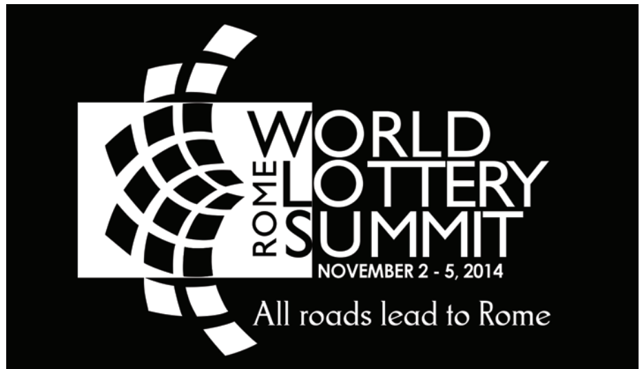
The official World Lottery Summit, Rome logo