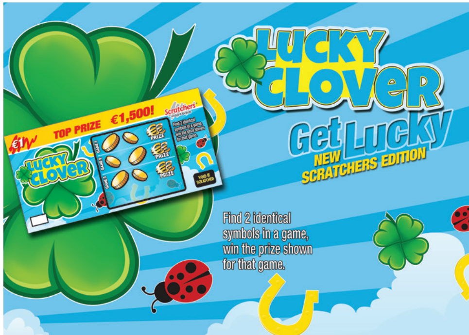
The new €1 edition of Scratchers - The Lucky Clover