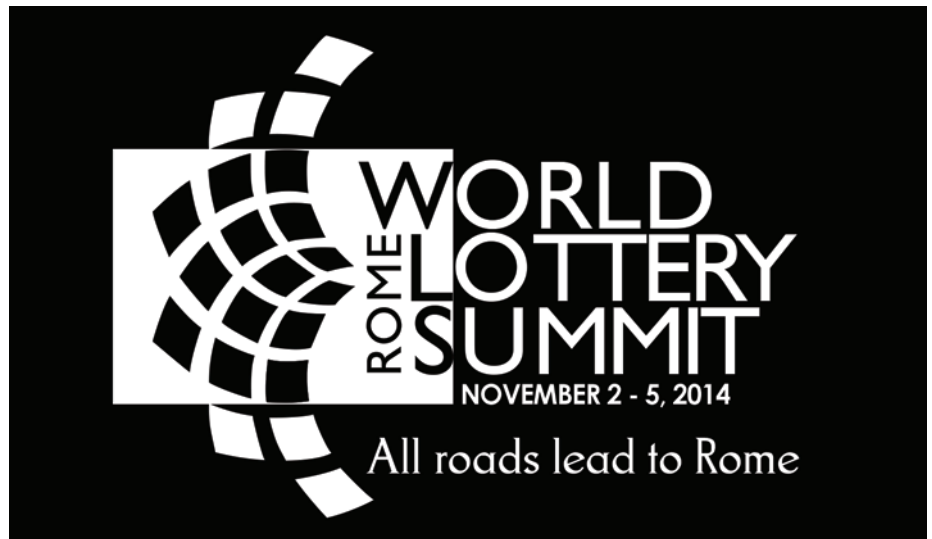
The official World Lottery Summit, Rome logo